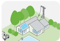
Residential grid-tie solar with backup power